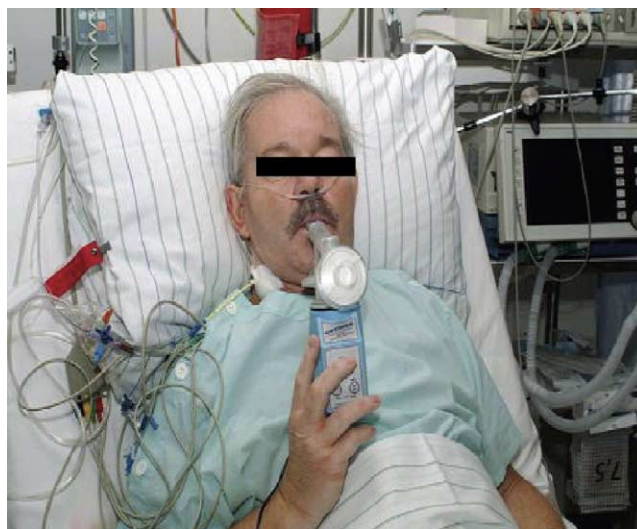
Fig. 1 Iloprost-inhalation by ultrasonic nebulization.

Measurements of hemodynamics were performed using a radial artery catheter (PICCO, Pulsion GmbH) and a pulmonary artery catheter (model CCO-V-CCO/CEDV/177F75, Edwards Lifesciences, Irvine, CA, USA), inserted via the left jugular vein. The following variables were measured or calculated: systolic, diastolic, and mean arterial blood pressure (MAP); heart rate (HR); systolic, diastolic, and mean pulmonary arterial pressure; central venous pressure (CVP); pulmonary capillary wedge pressure